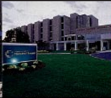
Memorial Hospital Seymour