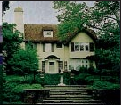
Governor Whitcomb's Former Home