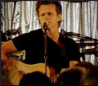
Mellencamp on Stage