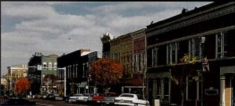
Downtown Seymour, the Inspiration for John's Hit Song "Small Town."

Mellencamp