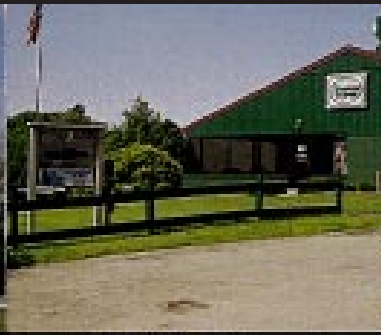
Dakota Ridge Restaurant