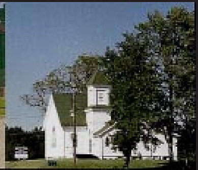
Rockford United Methodist Church