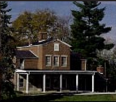
Southern Indiana Center For The Arts