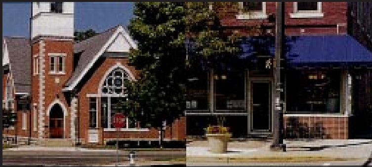
First Presbyterian Church